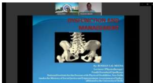
Fig3: Speaker explained basics of SI joint