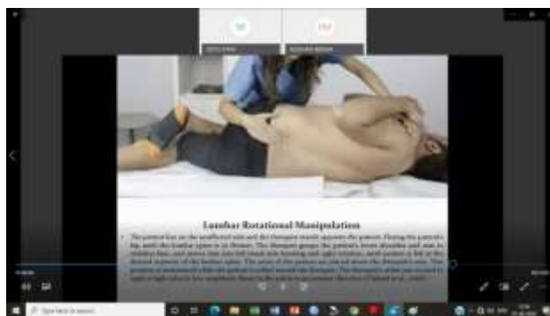
Fig2: Subject expert explained manipulation through audio visual aids

d) Screenshots of Webinar/ Picture of Event: