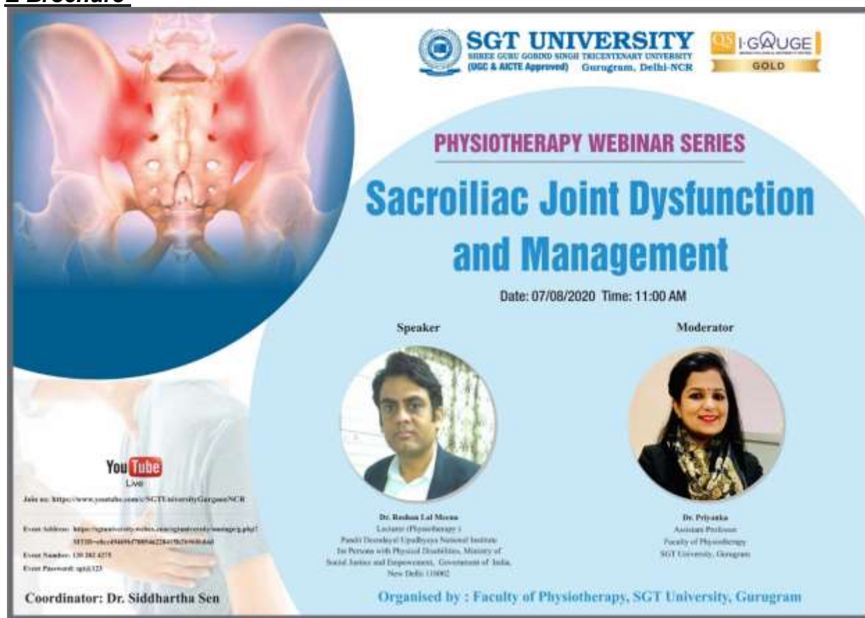
Fig1: E Banner